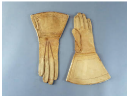
Title: Pair of Gloves Medium: Leather