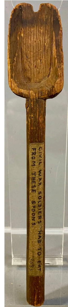
Title: Spoon Medium: Carved wood