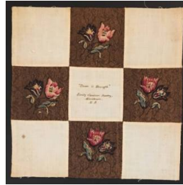
Title: "Union is Strength" Nine Patch Quilt Block Medium: Cotton