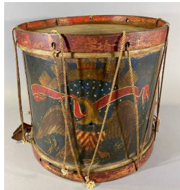
Title: Drum Primary Maker: Joseph LaMotte Medium: Pine, maple, ash, cotton cord, leather