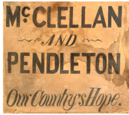
Title: Political Banner Medium: Black ink over graphite on woven cotton