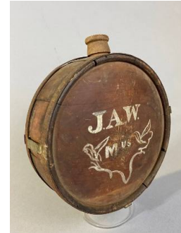
Title: Canteen Medium: Oak, iron, tin