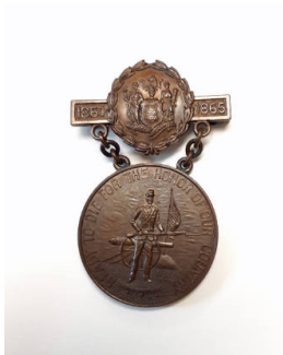
Title: New Jersey Civil War Veteran Medal Medium: Bronze