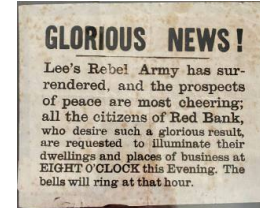
Title: Broadside Medium: Paper