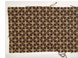
Title: Shawl Fragment Medium: wool