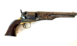
Title: Navy Colt Pistol Primary Maker: Colt's Manufacturing Company Medium: Walnut, steel, brass