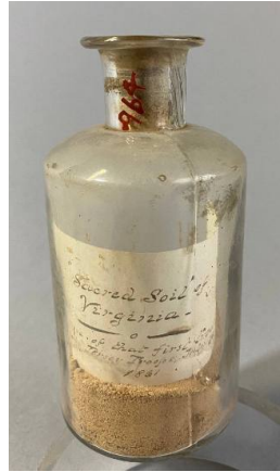
Title: Sacred Soil of Virginia Medium: Glass, soil