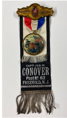
Title: GAR Freehold Post Badge Medium: Silk, aluminum, metal alloy, metallic thread