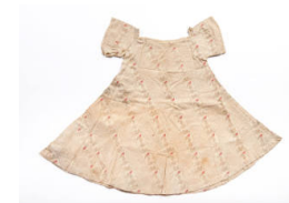
Title: Dress Medium: Cotton