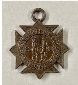
Title: Gettysburg Reunion Medal Medium: Iron