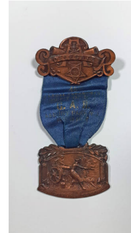
Title: Grand Army of the Republic Commemorative Badge, 1912 Medium: Bronze, silk