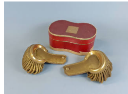
Title: Epaulets and Box Medium: Steel, brass, cotton, bullion wire, cardboard