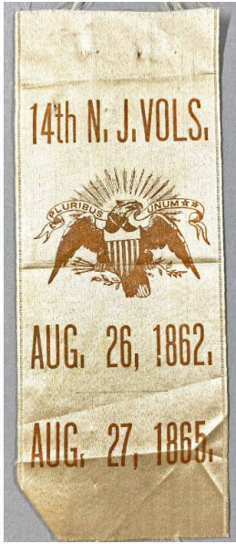
Title: 14th New Jersey Volunteer Ribbon Medium: Silk