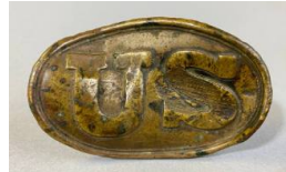
Title: Buckle Primary Maker: Charles Liming Medium: Brass