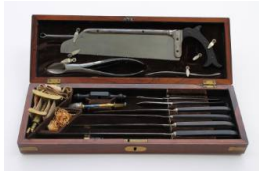
Title: Surgical Kit Primary Maker: Wade & Ford Medium: Mahogany, brass, velvet, steel