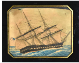
Title: U. S. Frigate Constitution Primary Maker: Unknown Artist Medium: Watercolor, ink and gouache on paper